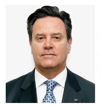
"There is a lot of financing going from China into Africa state financing enterprises but Indian investment is quite productive as it goes into certain sectors that are creating employment which we like a lot."

Ambassador Gurjit Singh has the distinction to be in Timor-Leste, Ethiopia and Republic of Djibouti in different capacities and has also been a India's representative to the African Union, UNECA and IGAD. "This political effort is not matched by an expansion of our economic engagements. The reason is not the lack of political will but the match-making with trade and investment and Exim Banks loans is not taking place."