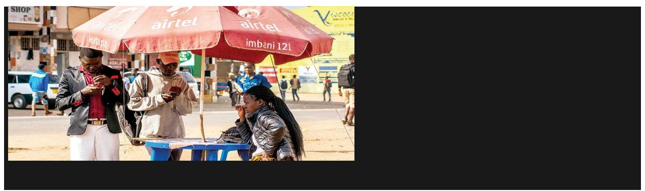
19 March, 2019 by Manish Kumar Jha

Why India needs an integrated approach to up its investment numbers in Africa and why it must match the political outreach with a robust economic model for the continent