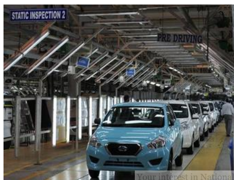
Nissan sues India for $770 mn