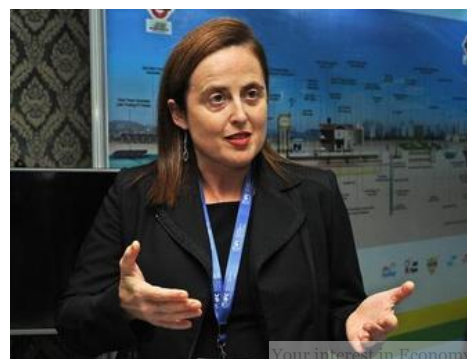
'Climate finance is going to be big in India'