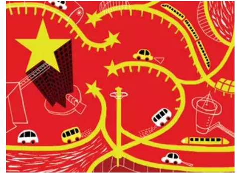
India and Japan feel that by intensifying cooperation with Africa, they can help each other and Africa

"India and Japan feel that by intensifying cooperation with Africa, they can help each other and Africa. We are working on the AAGC in our own way and at our own pace," said the former High Commissioner to South Africa and Kenya.