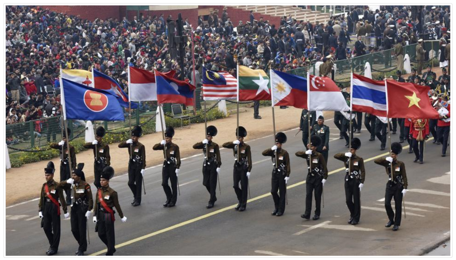
Army personnel \ carrying \ national \ flags \ of \ Asean \ countries \ during \ a \ dress \ rehearsal for \ the \ Republic \ Day \ Parade, \ New \ Delhi, \ India, \ January \ 23, \ 2018

As we celebrate the Silver Jubilee of the India-Asean partnership and 50 years of Asean, it makes sense to look at the new areas which could contribute to deeper ties in trade and investment between the 10-member grouping and India. These include: Global Production Networks (GPNs), new technologies, artificial intelligence and services.