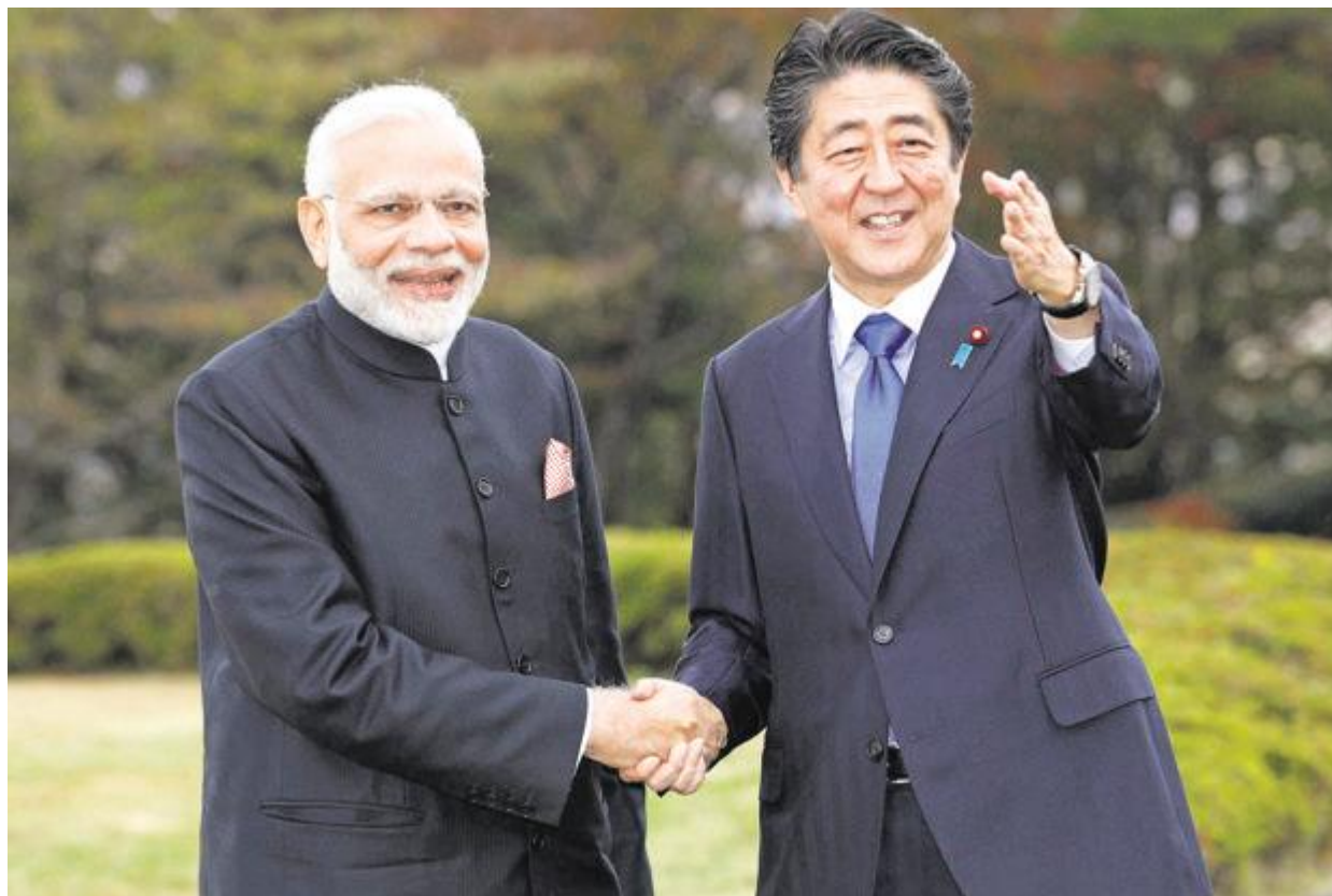
Prime Minister Narendra Modi with Japan's Prime Minister Shinzo Abe in Yamanakako village, Yamanashi prefecture.

Prime Minister Narendra Modi is in Japan for the fifth bilateral summit with Japanese counterpart Shinzo Abe. The two are expected to build on "special strategic and global